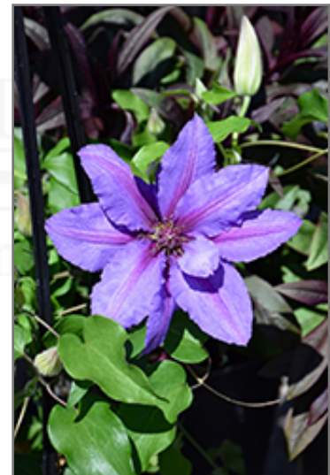
Tumaini Clematis flowers