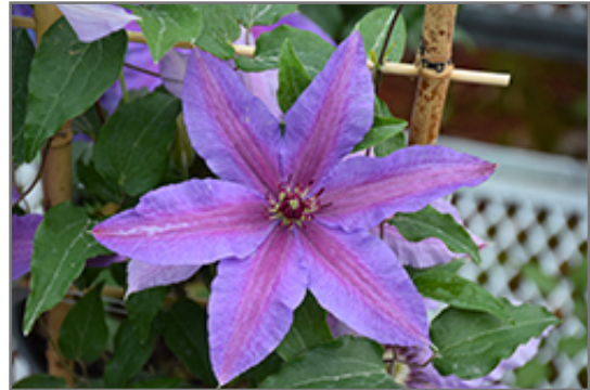
Tumaini Clematis flowers

Tumaini Clematis is a multi-stemmed deciduous woody vine with a twining and trailing habit of growth. Its average texture blends into the landscape, but can be balanced by one or two finer or coarser trees or shrubs for an effective composition.