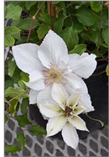
Guernsey Flute Clematis flowers

Guernsey Flute Clematis is recommended for the following landscape applications;