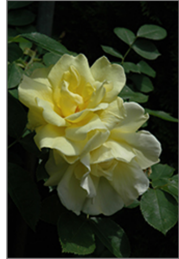
Carefree Sunshine Rose flowers

Carefree Sunshine Rose is recommended for the following landscape applications;