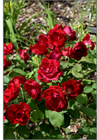
Emily Carr Rose flowers

Emily Carr Rose is recommended for the following landscape applications;