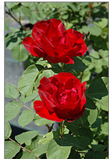
Emily Carr Rose flowers