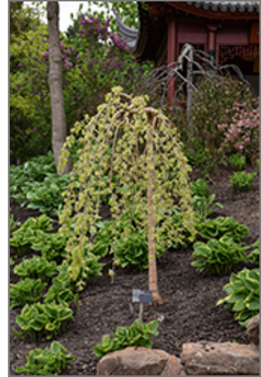
Chaparral Weeping Mulberry in bloom

This shrub performs well in both full sun and full shade. It is very adaptable to both dry and moist locations, and should do just fine under average home landscape conditions. It is considered to be drought-tolerant, and thus makes an ideal choice for xeriscaping or the moisture-conserving landscape. It is not particular as to soil type or pH, and is able to handle environmental salt. It is highly tolerant of urban pollution and will even thrive in inner city environments. This is a selected variety of a species not originally from North America.