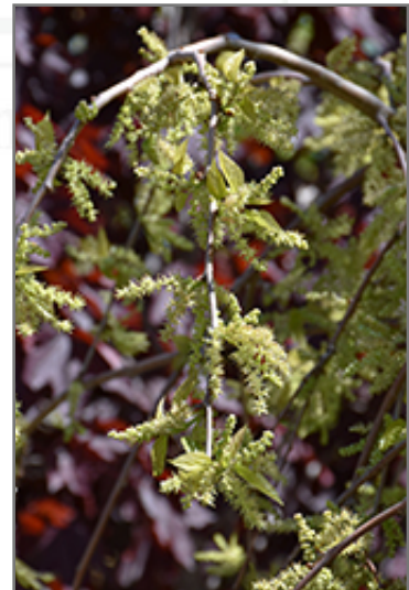
Chaparral Weeping Mulberry flowers