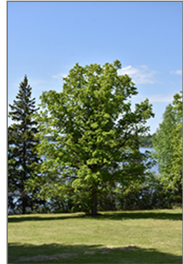
Bur Oak

This tree should only be grown in full sunlight. It is very adaptable to both dry and moist locations, and should do just fine under average home landscape conditions. It is considered to be drought-tolerant, and thus makes an ideal choice for xeriscaping or the moisture-conserving landscape. It is not particular as to soil type or pH. It is somewhat tolerant of urban pollution. This species is native to parts of North America.