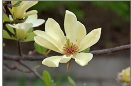
Butterflies Magnolia flowers

Butterflies Magnolia is recommended for the following landscape applications;