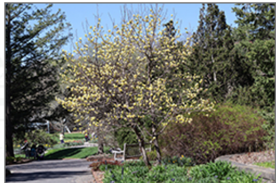
Butterflies Magnolia in bloom