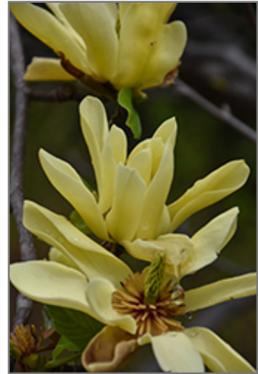
Butterflies Magnolia flowers

This tree does best in full sun to partial shade. It requires an evenly moist well-drained soil for optimal growth, but will die in standing water. It is not particular as to soil type, but has a definite preference for acidic soils. It is quite intolerant of urban pollution, therefore inner city or urban streetside plantings are best avoided. Consider applying a thick mulch around the root zone in winter to protect it in exposed locations or colder microclimates. This particular variety is an interspecific hybrid.