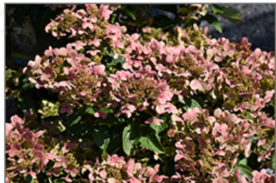
Early Evolution Hydrangea flowers