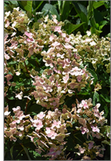
Early Evolution Hydrangea flowers

Early Evolution Hydrangea is recommended for the following landscape applications;