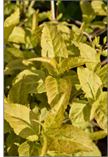
Firefly Diervilla foliage

This shrub does best in full sun to partial shade. It is very adaptable to both dry and moist locations, and should do just fine under average home landscape conditions. This plant does not require much in the way of fertilizing once established. It is not particular as to soil type or pH. It is somewhat tolerant of urban pollution. This particular variety is an interspecific hybrid.