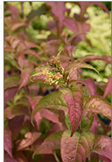
Firefly Diervilla flowers