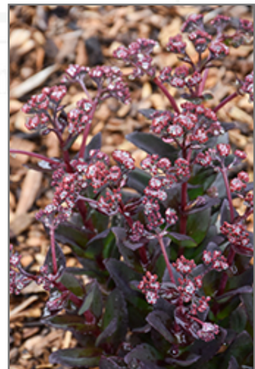
Conga Line Stonecrop flowers