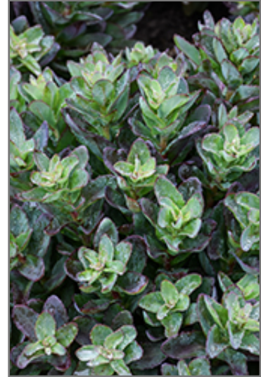
Conga Line Stonecrop foliage

Conga Line Stonecrop is a dense herbaceous perennial with an upright spreading habit of growth. Its relatively coarse texture can be used to stand it apart from other garden plants with finer foliage.