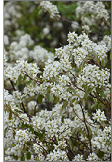
Saskatoon flowers

Saskatoon is a multi-stemmed deciduous shrub with an upright spreading habit of growth. Its relatively fine texture sets it apart from other landscape plants with less refined foliage.