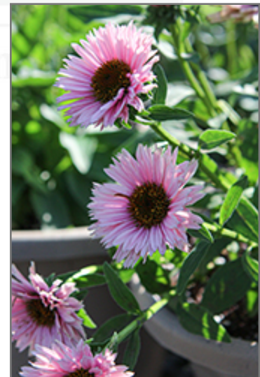
SunSeekers Salmon Coneflower flowers