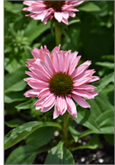
SunSeekers Salmon Coneflower flowers

SunSeekers Salmon Coneflower is an herbaceous perennial with an upright spreading habit of growth. Its medium texture blends into the garden, but can always be balanced by a couple of finer or coarser plants for an effective composition.