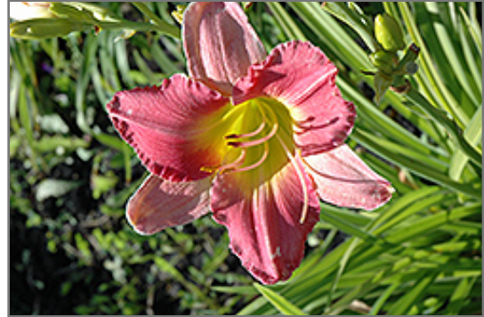
Final Touch Daylily flowers

Plant Height: 24 inches Flower Height: 32 inches Spread: 24 inches Spacing: 18 inches Sunlight: ☉ ● Hardiness Zone: 2b