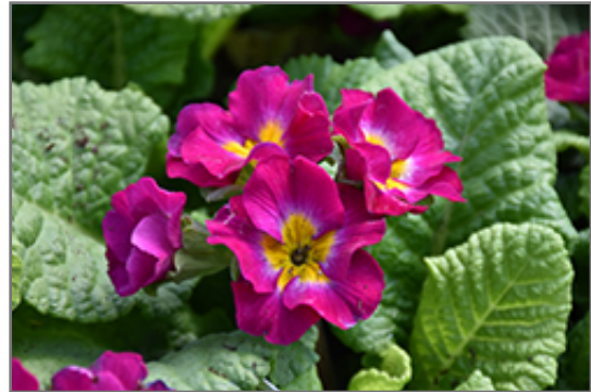
Pacific Giant Purple Primrose flowers

Pacific Giant Purple Primrose is recommended for the following landscape applications;