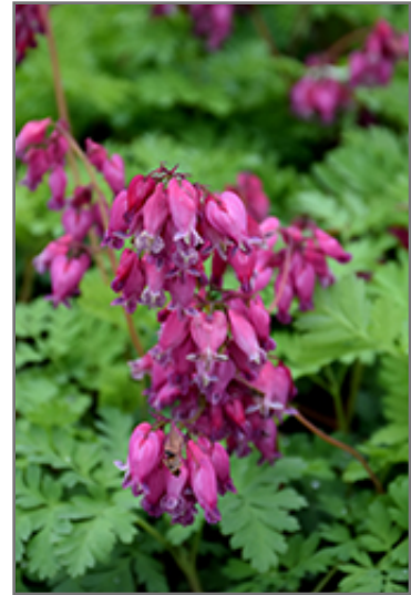
Luxuriant Bleeding Heart flowers

Luxuriant Bleeding Heart is an herbaceous perennial with a mounded form. It brings an extremely fine and delicate texture to the garden composition and should be used to full effect.