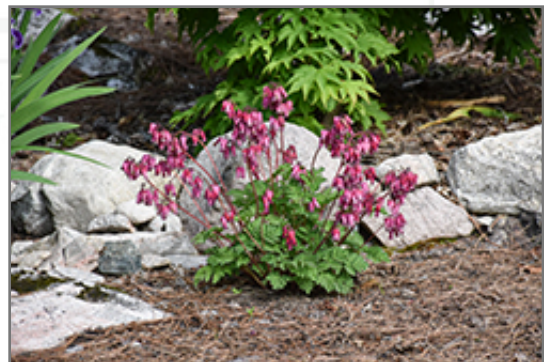
Luxuriant Bleeding Heart in bloom