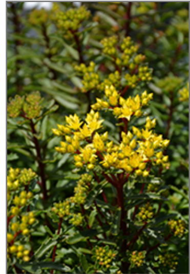
Yellow Diamonds Stonecrop flowers

Yellow Diamonds Stonecrop is a dense herbaceous perennial with a mounded form. It brings an extremely fine and delicate texture to the garden composition and should be used to full effect.