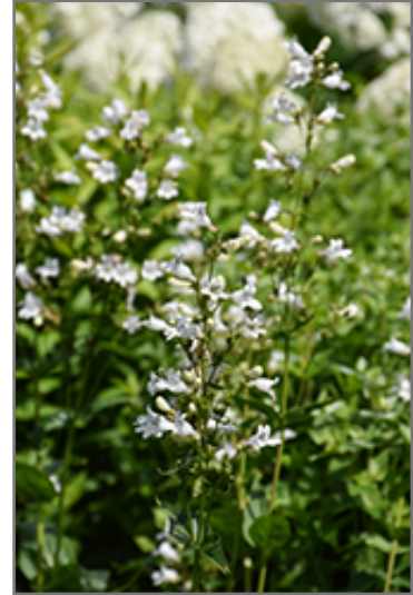
Foxglove Beardtongue flowers

This is a relatively low maintenance plant, and is best cleaned up in early spring before it resumes active growth for the season. It is a good choice for attracting butterflies to your yard. It has no significant negative characteristics.