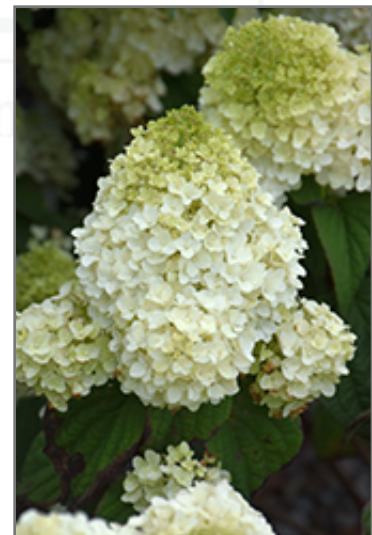
Little Hottie Hydrangea flowers