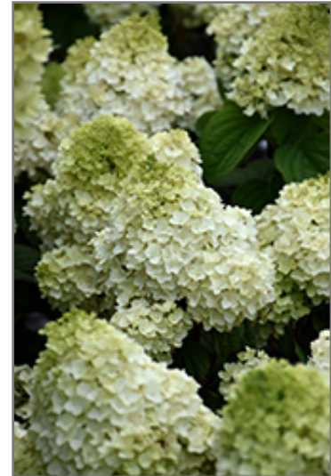
Little Hottie Hydrangea flowers

Little Hottie Hydrangea is recommended for the following landscape applications;