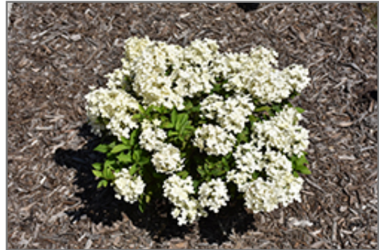
Tiny Quick Fire Hydrangea in bloom

Tiny Quick Fire Hydrangea makes a fine choice for the outdoor landscape, but it is also well-suited for use in outdoor pots and containers. With its upright habit of growth, it is best suited for use as a 'thriller' in the 'spiller-thriller-filler' container combination; plant it near the center of the pot, surrounded by smaller plants and those that spill over the edges. It is even sizeable enough that it can be grown alone in a suitable container. Note that when grown in a container, it may not perform exactly as indicated on the tag - this is to be expected. Also note that when growing plants in outdoor containers and baskets, they may require more frequent waterings than they would in the yard or garden. Be aware that in our climate, most plants cannot be expected to survive the winter if left in containers outdoors, and this plant is no exception. Contact our experts for more information on how to protect it over the winter months.