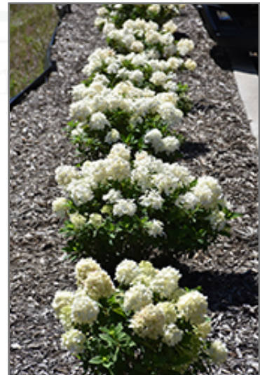
Tiny Quick Fire Hydrangea in bloom