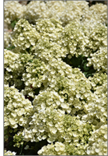
Tiny Quick Fire Hydrangea flowers

Tiny Quick Fire Hydrangea is recommended for the following landscape applications;