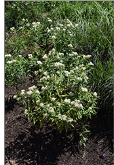
Ice Ballet Milkweed in bloom

This plant does best in full sun to partial shade. It is quite adaptable, preferring to grow in average to wet conditions, and will even tolerate some standing water. It is not particular as to soil type or pH. It is quite intolerant of urban pollution, therefore inner city or urban streetside plantings are best avoided. This is a selection of a native North American species. It can be propagated by division; however, as a cultivated variety, be aware that it may be subject to certain restrictions or prohibitions on propagation.