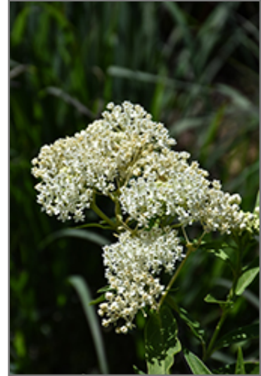
Ice Ballet Milkweed flowers

Ice Ballet Milkweed is recommended for the following landscape applications;