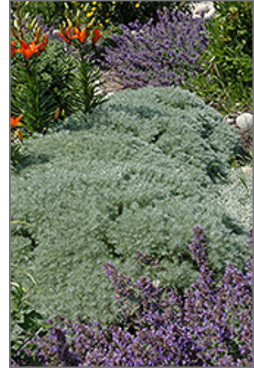
Silver Mound Artemisia

Silver Mound Artemisia is recommended for the following landscape applications;