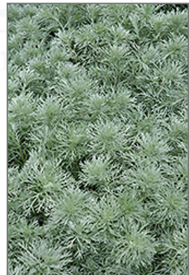
Silver Mound Artemisia foliage