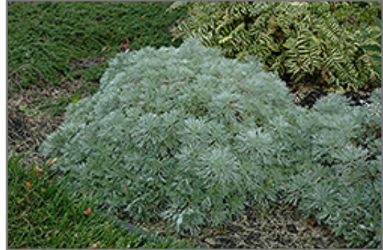
Silver Mound Artemisia

Silver Mound Artemisia will grow to be about 12 inches tall at maturity, with a spread of 18 inches. Its foliage tends to remain dense right to the ground, not requiring facer plants in front. It grows at a fast rate, and under ideal conditions can be expected to live for approximately 10 years. As an herbaceous perennial, this plant will usually die back to the crown each winter, and will regrow from the base each spring. Be careful not to disturb the crown in late winter when it may not be readily seen!