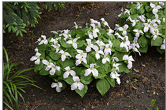
Great White Trillium in bloom