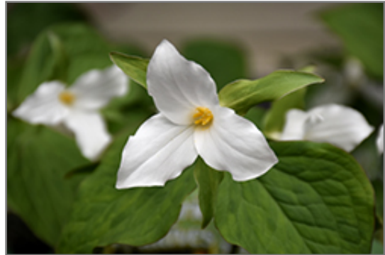
Great White Trillium flowers