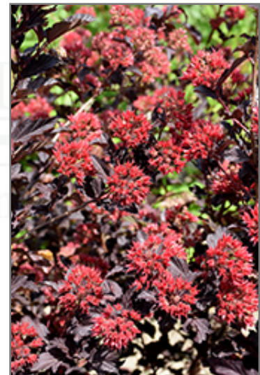
Center Glow Ninebark fruit