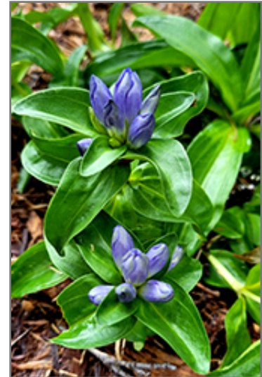
Closed Bottle Gentian flowers

Closed Bottle Gentian is recommended for the following landscape applications;