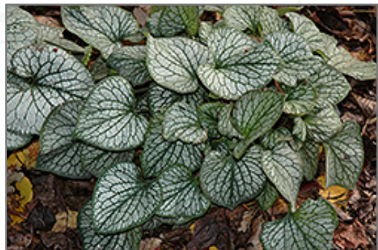
Jack Frost Bugloss foliage