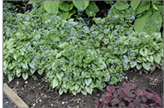
Jack Frost Bugloss in bloom

Jack Frost Bugloss is a fine choice for the garden, but it is also a good selection for planting in outdoor pots and containers. It is often used as a 'filler' in the 'spiller-thriller-filler' container combination, providing a mass of flowers and foliage against which the thriller plants stand out. Note that when growing plants in outdoor containers and baskets, they may require more frequent waterings than they would in the yard or garden. Be aware that in our climate, most plants cannot be expected to survive the winter if left in containers outdoors, and this plant is no exception. Contact our experts for more information on how to protect it over the winter months.