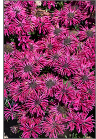
Leading Lady Razzberry Beebalm flowers

This variety forms a dense, compact mound of bright, raspberry purple flowers, on well branched, strong stems, over lush dark green foliage that has an excellent resistance to powdery mildew; great for massing along border fronts