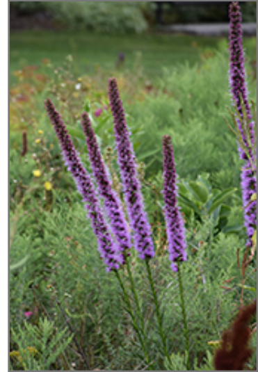
Blazing Star flowers