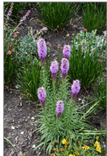
Blazing Star in bloom