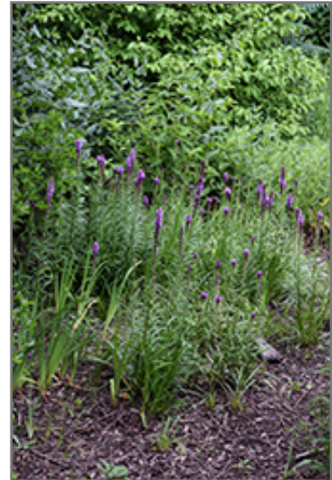
Blazing Star in bloom

Blazing Star is a fine choice for the garden, but it is also a good selection for planting in outdoor pots and containers. With its upright habit of growth, it is best suited for use as a 'thriller' in the 'spiller-thriller-filler' container combination; plant it near the center of the pot, surrounded by smaller plants and those that spill over the edges. It is even sizeable enough that it can be grown alone in a suitable container. Note that when growing plants in outdoor containers and baskets, they may require more frequent waterings than they would in the yard or garden. Be aware that in our climate, most plants cannot be expected to survive the winter if left in containers outdoors, and this plant is no exception. Contact our experts for more information on how to protect it over the winter months.