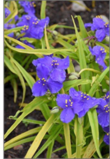
Sweet Kate Spiderwort flowers

Sweet Kate Spiderwort is recommended for the following landscape applications;