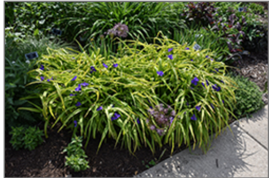
Sweet Kate Spiderwort in bloom

Sweet Kate Spiderwort will grow to be about 18 inches tall at maturity, with a spread of 18 inches. When grown in masses or used as a bedding plant, individual plants should be spaced approximately 14 inches apart. It grows at a fast rate, and under ideal conditions can be expected to live for approximately 10 years. As an herbaceous perennial, this plant will usually die back to the crown each winter, and will regrow from the base each spring. Be careful not to disturb the crown in late winter when it may not be readily seen! As this plant tends to go dormant in summer, it is best interplanted with late-season bloomers to hide the dying foliage.