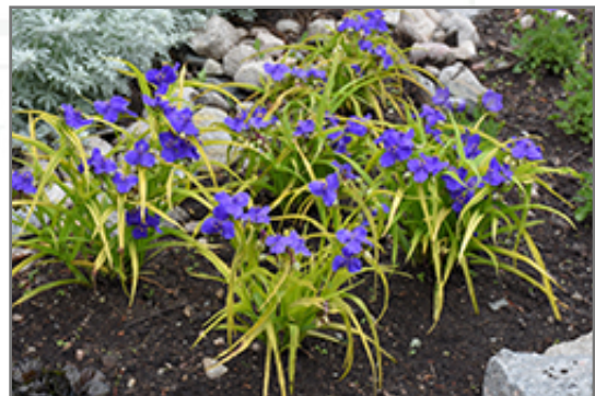
Sweet Kate Spiderwort in bloom