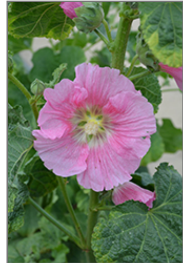
Spotlight Radiant Rose Hollyhock flowers

Stunning pink flowers with hot pink streaks, on tall, sturdy stalks in midsummer; this biennial is tolerant to the natural toxin formed by the roots of Black Walnut, but can be susceptible to Japanese beetles; plant in full sun for better growth