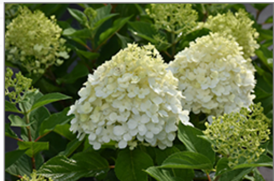
Fire Light Tidbit Hydrangea flowers