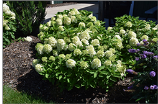
Fire Light Tidbit Hydrangea in bloom

Fire Light Tidbit Hydrangea makes a fine choice for the outdoor landscape, but it is also well-suited for use in outdoor pots and containers. Because of its height, it is often used as a 'thriller' in the 'spiller-thriller-filler' container combination; plant it near the center of the pot, surrounded by smaller plants and those that spill over the edges. It is even sizeable enough that it can be grown alone in a suitable container. Note that when grown in a container, it may not perform exactly as indicated on the tag - this is to be expected. Also note that when growing plants in outdoor containers and baskets, they may require more frequent waterings than they would in the yard or garden. Be aware that in our climate, most plants cannot be expected to survive the winter if left in containers outdoors, and this plant is no exception. Contact our experts for more information on how to protect it over the winter months.