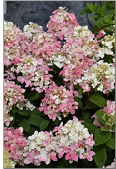
Fire Light Tidbit Hydrangea flowers (faded)

Fire Light Tidbit Hydrangea is recommended for the following landscape applications;