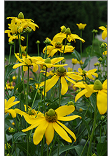
Autumn Sun Coneflower flowers

Autumn Sun Coneflower has masses of beautiful yellow daisy flowers with chartreuse eyes at the ends of the stems from mid summer to mid fall, which are most effective when planted in groupings. The flowers are excellent for cutting. Its serrated pointy leaves remain dark green in colour throughout the season.