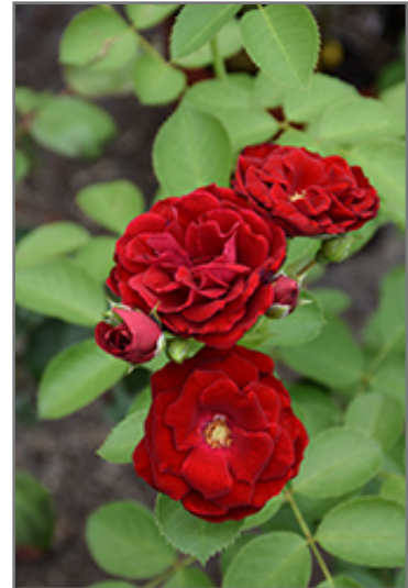
Cherry Frost Rose flowers