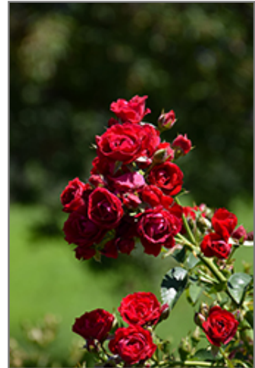
Cherry Frost Rose flowers

This woody vine should only be grown in full sunlight. It does best in average to evenly moist conditions, but will not tolerate standing water. It is not particular as to soil type or pH. It is highly tolerant of urban pollution and will even thrive in inner city environments. This particular variety is an interspecific hybrid.