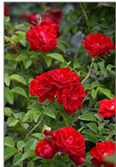
Cherry Frost Rose flowers