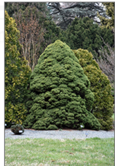
Dwarf Alberta Spruce