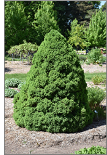
Dwarf Alberta Spruce