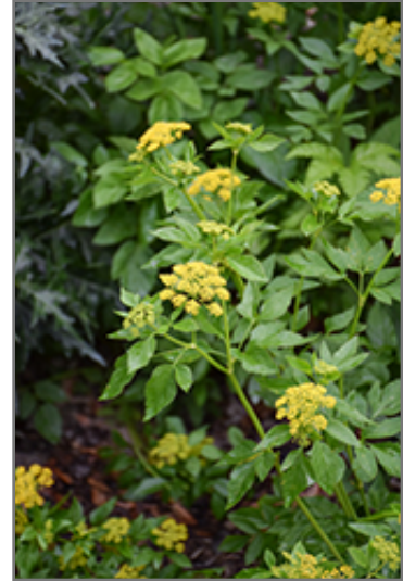
Golden Alexander flowers