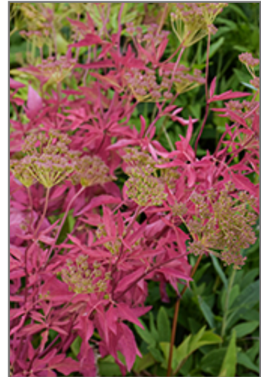
Golden Alexander in fall

Golden Alexander is a fine choice for the garden, but it is also a good selection for planting in outdoor pots and containers. With its upright habit of growth, it is best suited for use as a 'thriller' in the 'spiller-thriller-filler' container combination; plant it near the center of the pot, surrounded by smaller plants and those that spill over the edges. It is even sizeable enough that it can be grown alone in a suitable container. Note that when growing plants in outdoor containers and baskets, they may require more frequent waterings than they would in the yard or garden. Be aware that in our climate, most plants cannot be expected to survive the winter if left in containers outdoors, and this plant is no exception. Contact our experts for more information on how to protect it over the winter months.