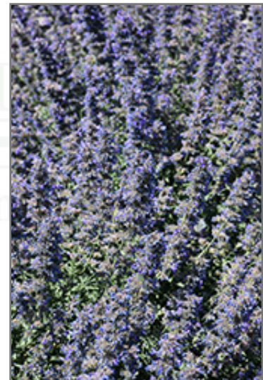
Walker's Low Catmint flowers