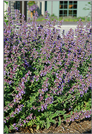
Walker's Low Catmint flowers

Walker's Low Catmint is a fine choice for the garden, but it is also a good selection for planting in outdoor pots and containers. It is often used as a 'filler' in the 'spiller-thriller-filler' container combination, providing a mass of flowers against which the thriller plants stand out. Note that when growing plants in outdoor containers and baskets, they may require more frequent waterings than they would in the yard or garden. Be aware that in our climate, most plants cannot be expected to survive the winter if left in containers outdoors, and this plant is no exception. Contact our experts for more information on how to protect it over the winter months.