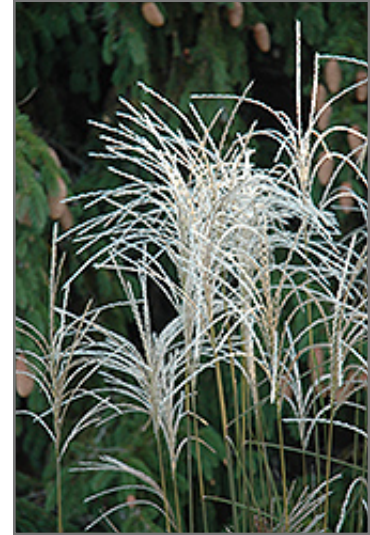
Graziella Maiden Grass fruit

Graziella Maiden Grass features dainty plumes of silver flowers rising above the foliage in late summer. The silver seed heads are carried on showy plumes displayed in abundance from early fall to late winter. Its grassy leaves are green in colour. The foliage often turns tan in fall. The tan stems can be quite attractive.