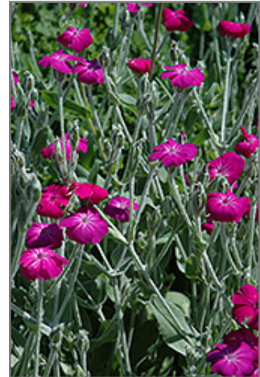
Rose Campion flowers