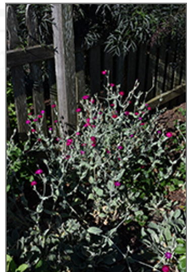
Rose Campion in bloom