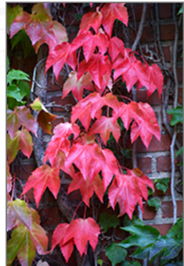
Boston Ivy in fall