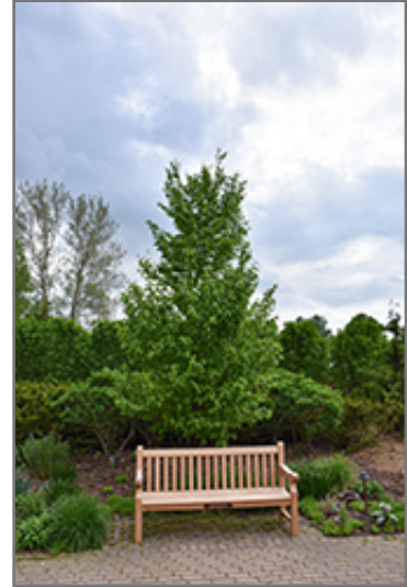
Hop Hornbeam