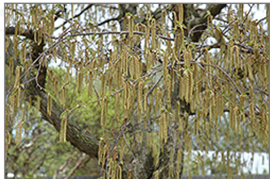
Hop Hornbeam flowers