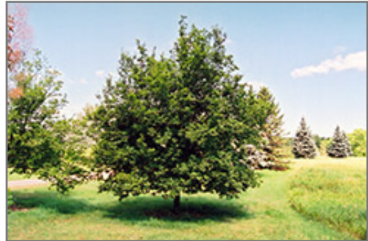
Hop Hornbeam

This tree does best in full sun to partial shade. It is very adaptable to both dry and moist locations, and should do just fine under average home landscape conditions. It is not particular as to soil type or pH. It is quite intolerant of urban pollution, therefore inner city or urban streetside plantings are best avoided, and will benefit from being planted in a relatively sheltered location. Consider applying a thick mulch around the root zone in winter to protect it in exposed locations or colder microclimates. This species is native to parts of North America.