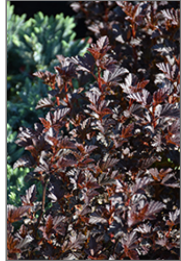
Summer Wine Black Ninebark foliage

This shrub will require occasional maintenance and upkeep, and can be pruned at anytime. It has no significant negative characteristics.