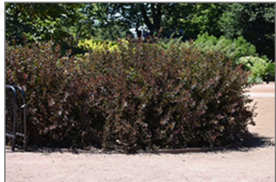
Summer Wine Black Ninebark