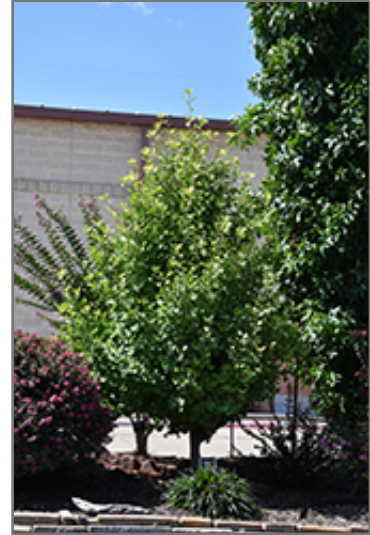
Goldspire Ginkgo