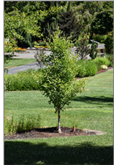
Goldspire Ginkgo

This tree should only be grown in full sunlight. It is very adaptable to both dry and moist locations, and should do just fine under average home landscape conditions. It is not particular as to soil type or pH, and is able to handle environmental salt. It is highly tolerant of urban pollution and will even thrive in inner city environments. Consider applying a thick mulch around the root zone in winter to protect it in exposed locations or colder microclimates. This is a selected variety of a species not originally from North America.