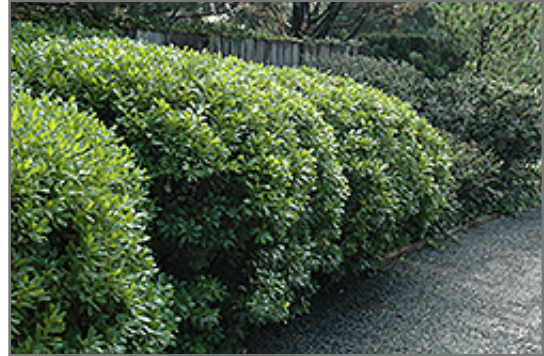
Northern Bayberry

Northern Bayberry is a dense multi-stemmed deciduous shrub with a more or less rounded form. Its average texture blends into the landscape, but can be balanced by one or two finer or coarser trees or shrubs for an effective composition.