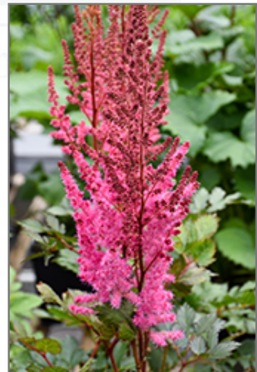
Mighty Chocolate Cherry Chinese Astilbe flowers