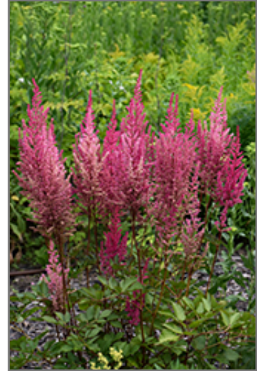
Mighty Chocolate Cherry Chinese Astilbe flowers

Mighty Chocolate Cherry Chinese Astilbe is an herbaceous perennial with an upright spreading habit of growth. Its relatively fine texture sets it apart from other garden plants with less refined foliage.