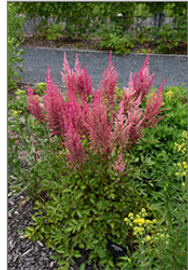
Mighty Chocolate Cherry Chinese Astilbe in bloom

Mighty Chocolate Cherry Chinese Astilbe will grow to be about 3 feet tall at maturity extending to 4 feet tall with the flowers, with a spread of 30 inches. When grown in masses or used as a bedding plant, individual plants should be spaced approximately 24 inches apart. Its foliage tends to remain dense right to the ground, not requiring facer plants in front. It grows at a medium rate, and under ideal conditions can be expected to live for approximately 10 years. As an herbaceous perennial, this plant will usually die back to the crown each winter, and will regrow from the base each spring. Be careful not to disturb the crown in late winter when it may not be readily seen!