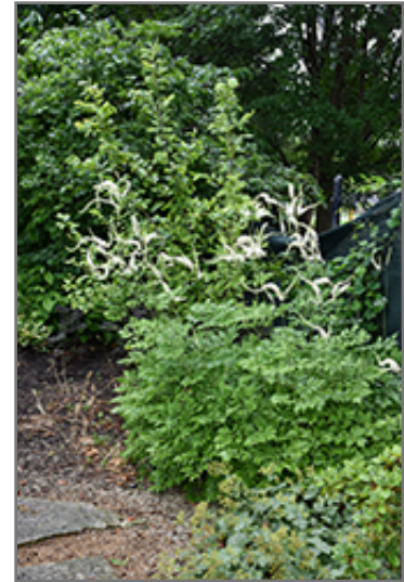
American Bugbane in bloom

This plant performs well in both full sun and full shade. It prefers to grow in moist to wet soil, and will even tolerate some standing water. It is not particular as to soil type or pH. It is somewhat tolerant of urban pollution. This species is native to parts of North America. It can be propagated by division.