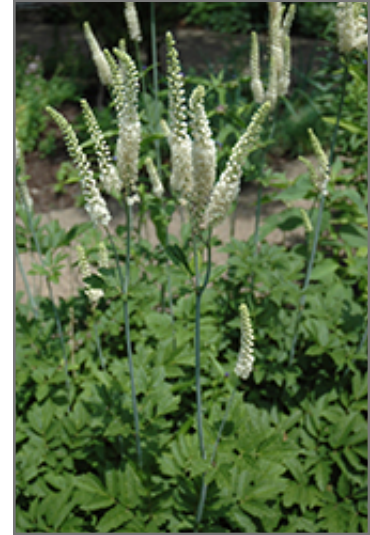
American Bugbane in bloom

American Bugbane is recommended for the following landscape applications;