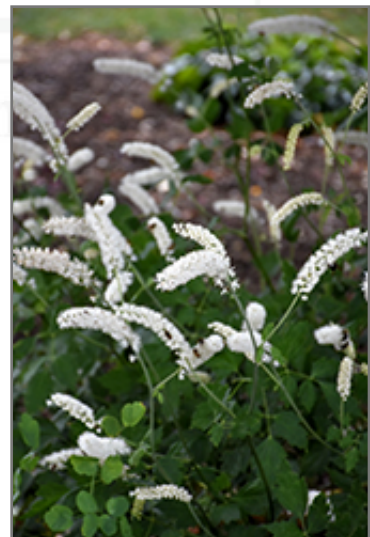
American Bugbane flowers