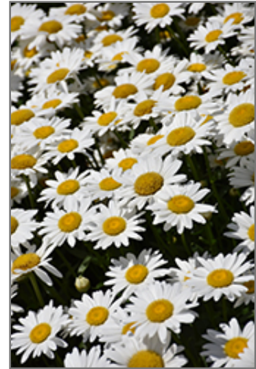
Becky Shasta Daisy flowers