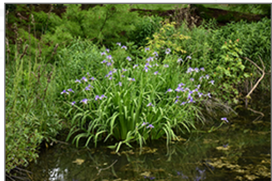
Blue Flag Iris in bloom