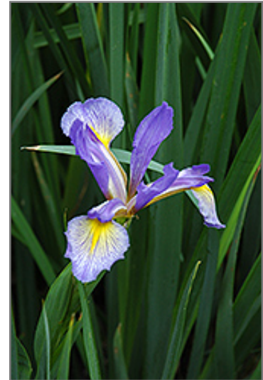
Blue Flag Iris flowers

This plant does best in full sun to partial shade. It is quite adaptable, preferring to grow in average to wet conditions, and will even tolerate some standing water. It is not particular as to soil type or pH. It is somewhat tolerant of urban pollution. This species is native to parts of North America. It can be propagated by division.