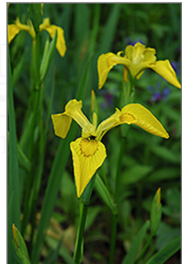
Yellow Flag Iris flowers