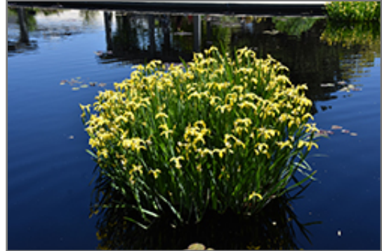
Yellow Flag Iris in bloom

Yellow Flag Iris is recommended for the following landscape applications;