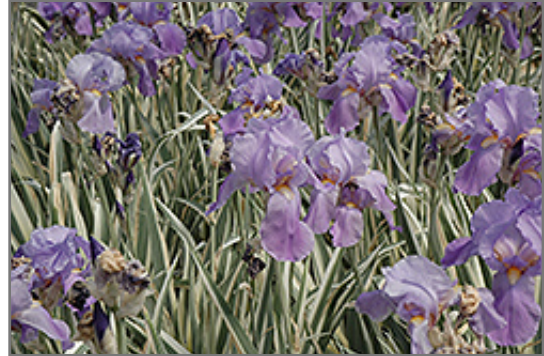
Variiegated Sweet Iris flowers

Variiegated Sweet Iris will grow to be about 18 inches tall at maturity extending to 24 inches tall with the flowers, with a spread of 18 inches. When grown in masses or used as a bedding plant, individual plants should be spaced approximately 14 inches apart. It grows at a medium rate, and under ideal conditions can be expected to live for approximately 10 years. As an herbaceous perennial, this plant will usually die back to the crown each winter, and will regrow from the base each spring. Be careful not to disturb the crown in late winter when it may not be readily seen!