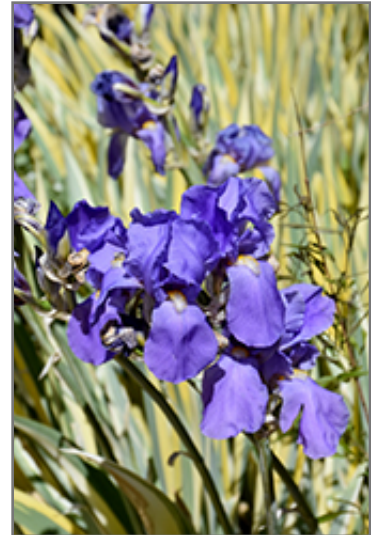
Variegated Sweet Iris flowers