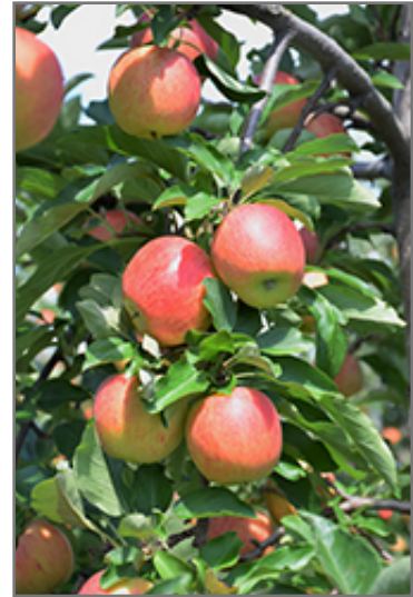
Royal Gala Apple fruit

Royal Gala Apple features showy clusters of lightly-scented white flowers with shell pink overtones along the branches in mid spring, which emerge from distinctive pink flower buds. It has forest green deciduous foliage. The pointy leaves turn yellow in fall. The fruits are showy ruby-red apples with a chartreuse blush, which are carried in abundance from late summer to mid fall. The fruit can be messy if allowed to drop on the lawn or walkways, and may require occasional clean-up.