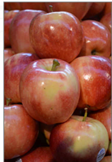
Royal Gala Apple fruit