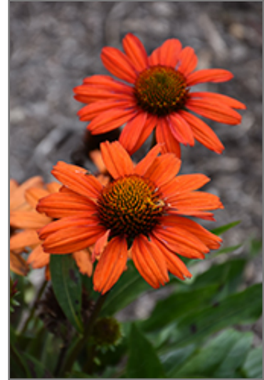
Kismet Red Coneflower flowers

Kismet Red Coneflower is an herbaceous perennial with an upright spreading habit of growth. Its medium texture blends into the garden, but can always be balanced by a couple of finer or coarser plants for an effective composition.