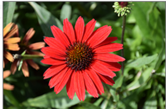
Kismet Red Coneflower flowers